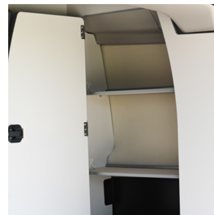
Wardrobe inlay shelf (2 piece) for the Nugget Plus

Code Trend/Trail: 281009248013 Code Active/Limited: 281063248016 Weight: Approx. 1 kg