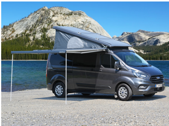
Articulated arm awning 2.60 m for Nugget Articulated arm awning 3.00 m for Nugget Plus

The provision of various awnings, the sun sail and the tailgate privacy screen enable you to significantly increase the space around your mobile home. The articulated arm awning is permanently mounted on the mobile home and can be extended in just a few moments with a crank handle. The sun awning provides you with protection and a cosy place to sit in front of the mobile home, especially when the sun is shining strongly. The tailgate privacy screen is simple to assemble. It not only protects you against the sun and uninvited glances, it is also perfectly suited for using the outdoor shower.