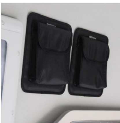
Pouch Set 2-part, roof

Code: 500119 Colour: Black Weight: Approx. 0.5 kg