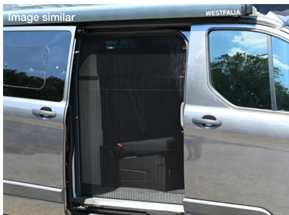
Mosquito net for the right-side sliding door

Code: 281009248047 Weight: Approx. 0.5 kg