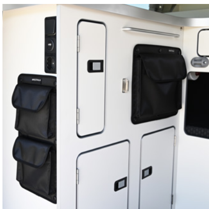
Pouch Set 2-part, kitchen

The harmonious adaptation of the additional pouches into the design of the vehicle interior discreetly provides you with additional storage space. Simple fixing and flexible utilisation provide you with more comfort.