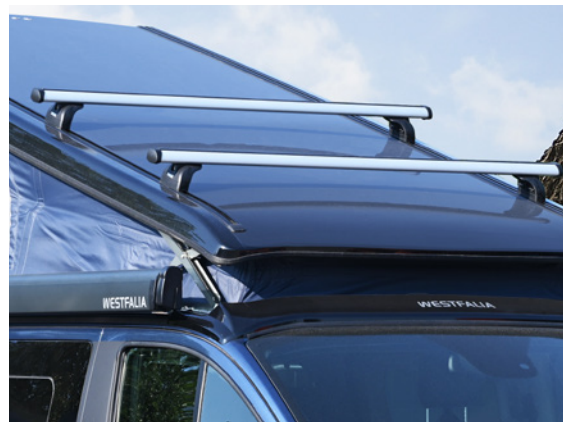
Thule roof rack for Nugget pop-up roof and Nugget Plus with pop-up roof (detailed view)