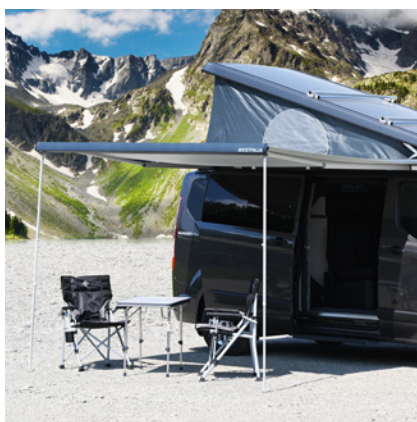
Outdoor package for the Nugget

Code Trend/Trail: 281060248016 Code Active/Limited: 281063248019 Weight: Approx. 16 kg