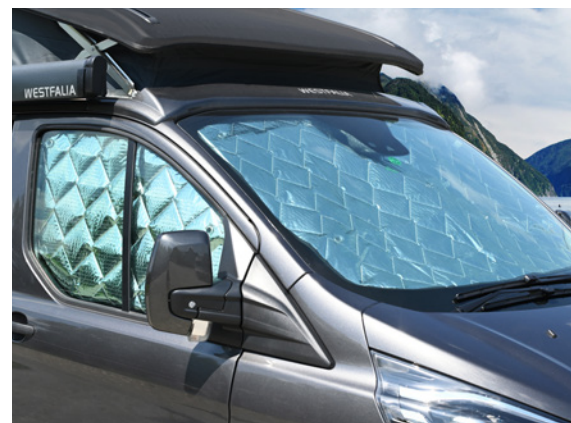
Isotherm driver compartment shading (serial feature)

Note: For the Nugget as well as for the Nugget Plus.