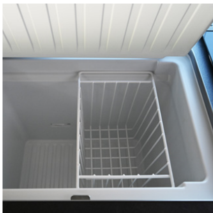
Suspension basket for cool box

Your foodstuff is always visibly retained.