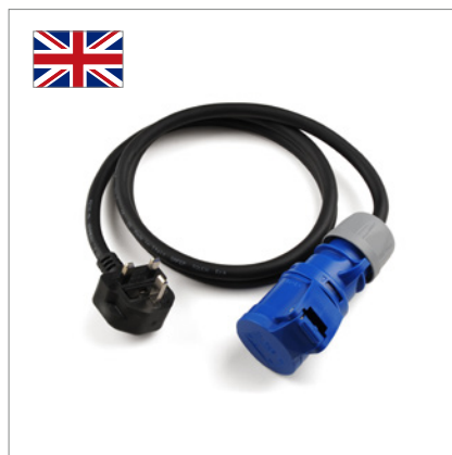
Adapter cable (serial feature GB)

Code: 507024 Length: Approx. 1.5 m Weight: Approx. 0.5 kg