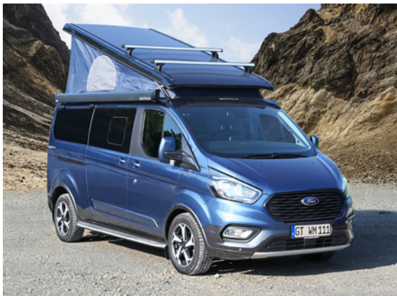
Thule roof rack for Nugget pop-up roof and Nugget Plus with pop-up roof

Mobile homes should always represent an optimum combination of spatial content and vehicle length. Especially in the case of compact panel vans, the question then arises of where to put bulky equipment such as sports equipment or position roof boxes. Because we have been working in this class for almost 60 years at Westfalia, we also of course have the accessories in order to meet these challenges. Whether this concerns a short trip or an extensive discovery tour - Westfalia offers roof racks in order to provide extra storage space and always be prepared for whatever comes up.