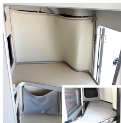
Wardrobe inlay shelf (1 piece) for the Nugget

Code: 500203 Colour: Black Weight: Approx. 0.3 kg