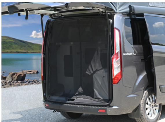
Mosquito net for the tailgate on Nugget Plus

These mosquito nets can protect you from even the smallest mosquitoes and are equipped with a zip in the middle to facilitate easy entry and exit. They are additionally equipped with a glare-free view. The material is flame retardant. The mosquito nets are easily attached with the help of press-on studs. The three-part insulating mat set protects against intense sunlight and additionally insulates in Winter. It thereby always ensures pleasant temperatures inside the vehicle. Attaching it is executed with suction cups.