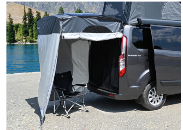
Tailgate privacy screen

Note: Scope of delivery: Sun canopy, pitching poles, guy ropes, pegs, pack sack; Material: Trailtex fabric, polyester fabric. PU-coated; Only available for vehicles with pop-up roof.