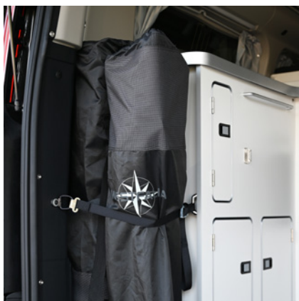
Outdoor package for the Nugget Plus

The outdoor package comprises one table and two folding chairs. The camping table is stored on the tailgate with a simple locking system in order to save as much space as possible. The camping chairs are attached to the kitchen with the help of a lashing system.