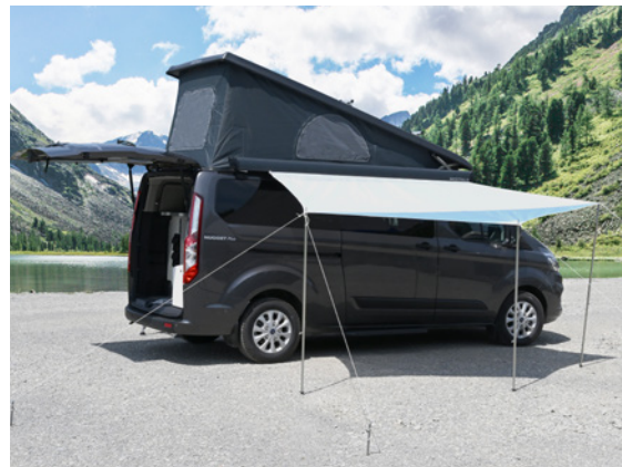
Westfalia Flexo sun canopy

Code: 538383 Weight: Approx. 5.22 kg Colour: grey/blue Dimensions: L 240 x D 170-250 cm Packaged dimension: 20 x 100 cm