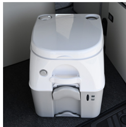
Domestic 976 chemical toilet for the Nugget

Code Trend/Trail: 281060248024 Code Active: 281063248024 Code Limited: 281065248024 Weight: Approx. 1 kg