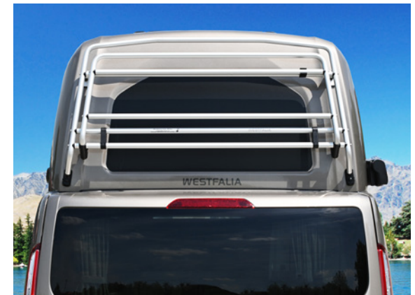
High roof rack, Nugget rear (not available for Nugget Plus)

Code: 281009248122 Weight: Approx. 5.6 kg Approved loading: maximum 20 kg, with even distribution